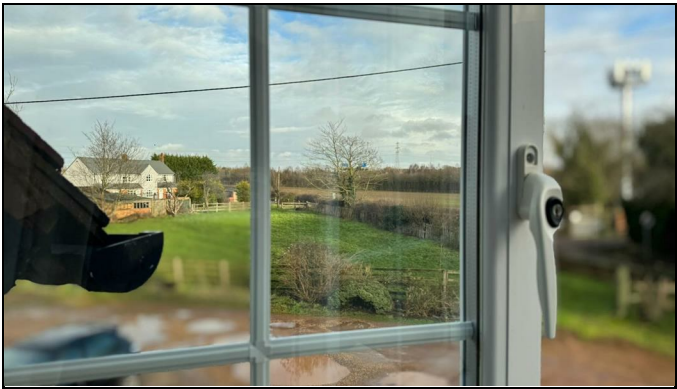
Ashleigh Mews Cottages, Curdworth, B76 9HE